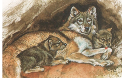
Koe tanov, sye tijis polke lava, kiatcolya va 3 ik 6 oc bak alubeasat ok teveasat nazbar. Ba kobira, idatcoloc va vof lukeptarkaf myot di ise tir wakaf aze arti 9 ik 12 vielrafenur. Arti 45 viel zo ukoykar, isen alf aldoo arti balenoy aksat kam tir vas 14 kg-.

Xali vas tanoya tolonja is inaf oocem is aryon milgaf idatcol tis leon tandaf sye ruldar. Dile lanbane sulemye va rictula ke « okkil » inaled. Battize levernaf kiatcol kabdue an idatcol jvotnedison su seriyar, nedition da va inafa moemuca kaprupur num batkane pokoleson da me fu zo dilfur.