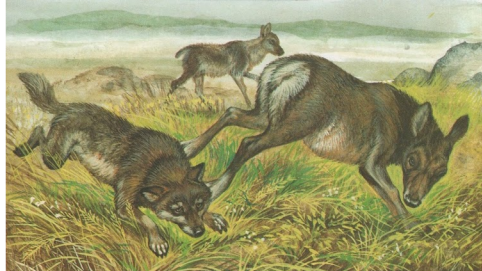
Idatcol va cpogoloc dilfutson al vanlarin. Voxen gadikya nimaftakison yateer. Idatcol mo! skaya ok onkara va wigva grabemer. Idatcolaf aples va bedakol sol tum jadion tsantsaater aze anamaturaze balier. Idulugalon meestyurini povi ke cewa rover da mayeol ok lerfaf rupol ok brestol ok pedraf zvert ( ininapikrafa barenis is gazaf kirz ) drikon malestudat.